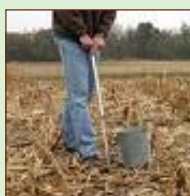
Soil, Manure, and Plant Tests ISU Extension