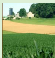
Best Management Practices