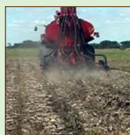
Nutrients Iowa State University